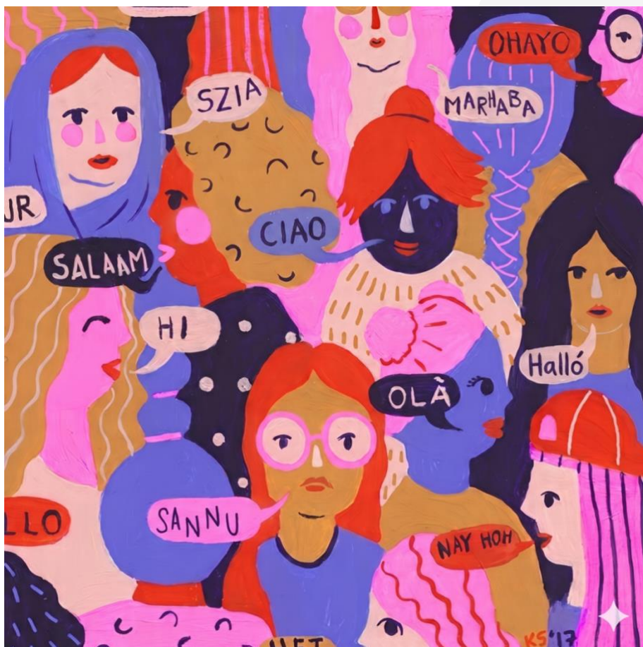
ILLUSTRATION OF THE PROJECT

The project investigates grammatical aspects of endogenous and exogenous (migration-induced) multilingualism in three metropolitan/urban areas, European (Naples, Reykjavík) and extra-European (Minneapolis, USA), integrating different strands and tools of research, in line with recent and current work on multilingualism in the diverse European and extra-European scenarios. It aims at documenting grammars in contact in multilingual settings, in relation to the interplay between the standard languages (Italian, Icelandic, English), the local varieties and the immigration (heritage/vehicular) languages (as L1, L2, or L3 etc.) in multilingual communication, focusing on school multilingualism in upper secondary schools (ISCED 3) and first year university students (ISCED 5).