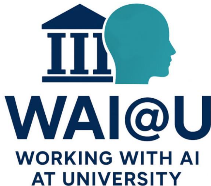
ILLUSTRATION OF THE PROJECT

This project aims to study the impact of AI and GIA on work in universities. This research focuses specifically on the three types of work found in universities: administrative work, teaching and research. WAI@U aims to compare the use and reception of G/AI at work in order to identify (IT), categorise, evaluate (Management) and regulate (Law) changes in an international and comparative context with the participation of three universities: UPEC Paris, UIBK Innsbruck, CBS Copenhagen.